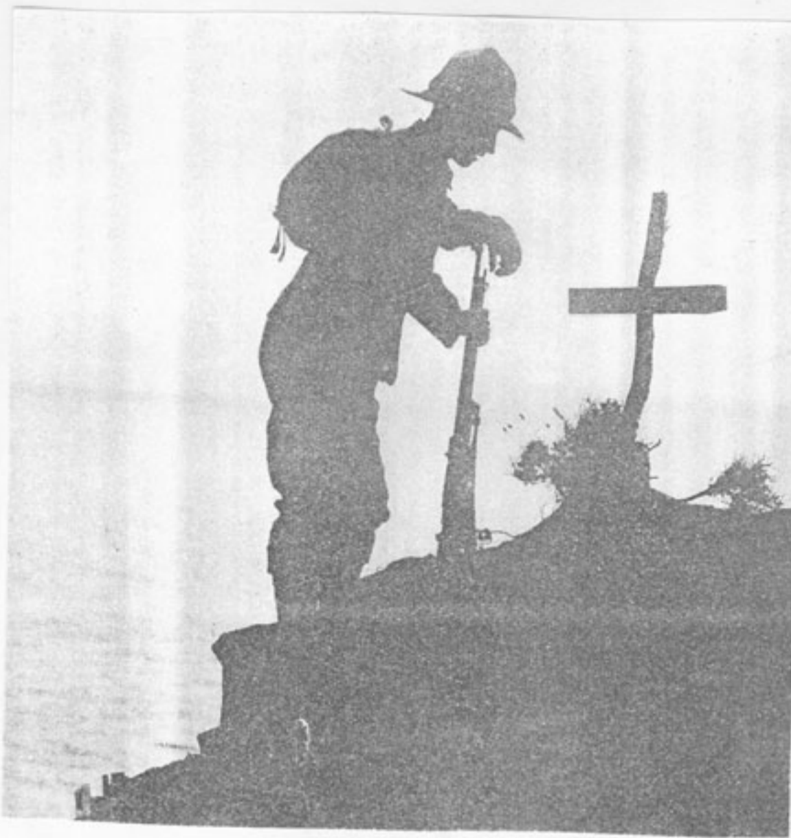
BRITISH SOLDIER VISITING A COMRADE'S GRAVE ON THE CLIFFS NEAR CAPE HELLES

"...Gallipoli, where over 2000 men of the Dublin and Munster Fusiliers and of the Hampshire Regiment took part in the memorable landing on "V" beach, to be shot to pieces there, and later - such as had survived - were responsible for the storming, amid further terrible loss, of Sed-el-Bahr".